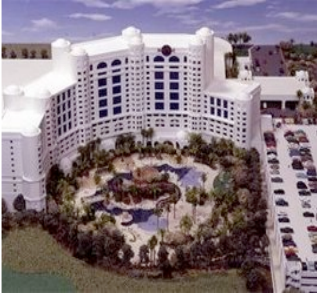
5-Star Mohegan Sun Casino